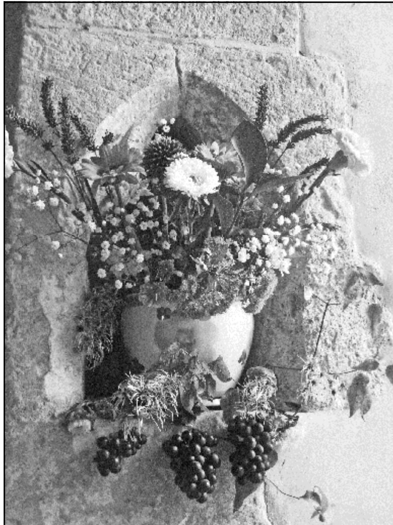
Harvest at Gussage St Andrew