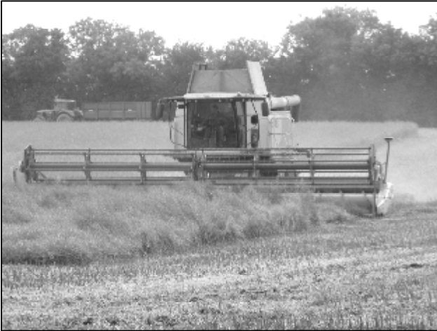
Combine working just two hundred yards from our cottage.

When I first came into farming, the headers on the combines which were 'devouring' the crops back in the late 1950s were 10 and 12 feet wide and they were considered to be the 'bees' knees' as far as harvesting was concerned. I suspect that the cutting tables of the ones I have just photographed today are six metres (twenty feet) wide and, of course, they were travelling at speeds far greater than those of my youth and far more efficiently, giving a much better seed sample with far less losses.