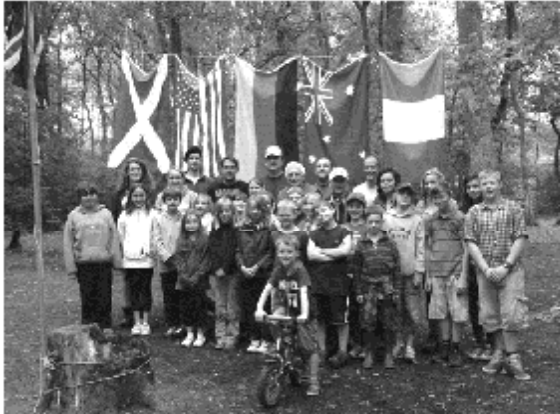
Summer Camp– Ferny Crofts 2011