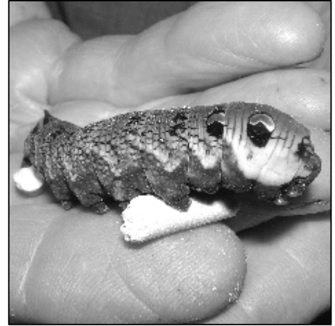
The Elephant Hawk Moth caterpillar